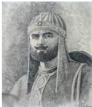
Sher Shah Sur

In last few hundred years of the Delhi Sultanate, many states such as Bengal, Gujarat, Rajasthan and Jaunpur had become independent. The later Tughluqs, Sayyid and Lodi dynasties ruled from Delhi and Agra. During this period, there was an emergence of the Rajputs and the Afghan nobles. At this time many small states became powerful. Sher Shah Sur who was managing a small territory in Bihar later defeated the Mughal emperor Humanyu. Sher Shah Sur was a brilliant administrator whose administrative policies were followed by Akbar.