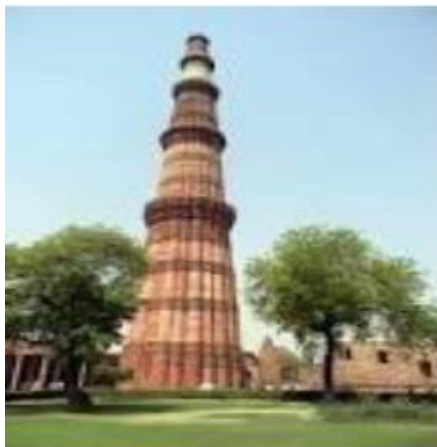
The Qutb Minar