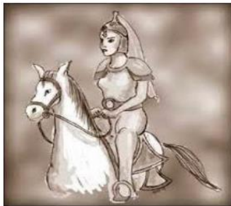
Razia Sultana, the first woman ruler of Delhi